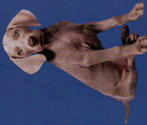
Weimaraner

For more information on responsible breeding and to contact a National Breed Club or local AKC-affiliated dog club, visit www.akc.org .