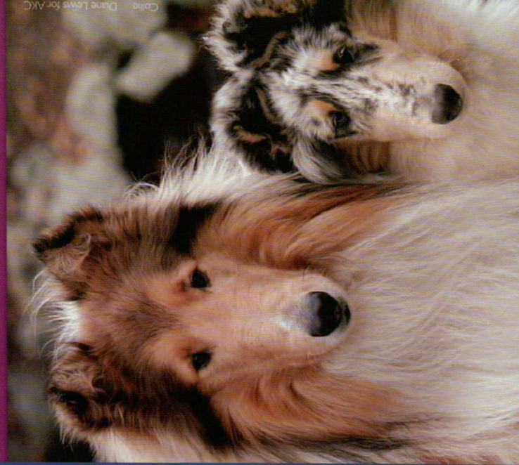
Collie